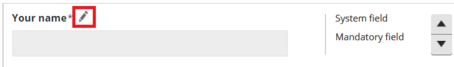
Figure 1: Click the Edit icon to edit a field